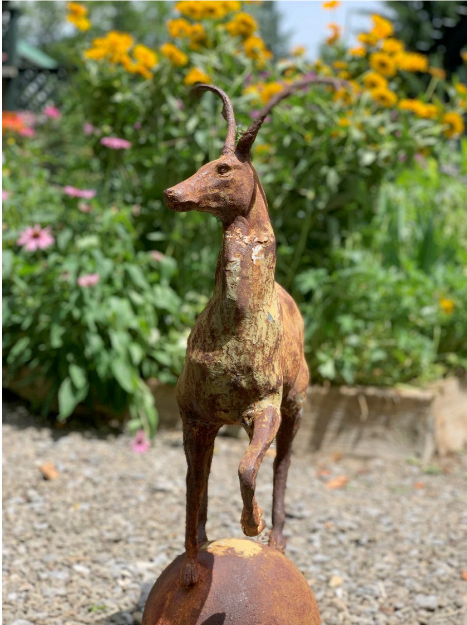
“ On Alert” Springfield Center Garden