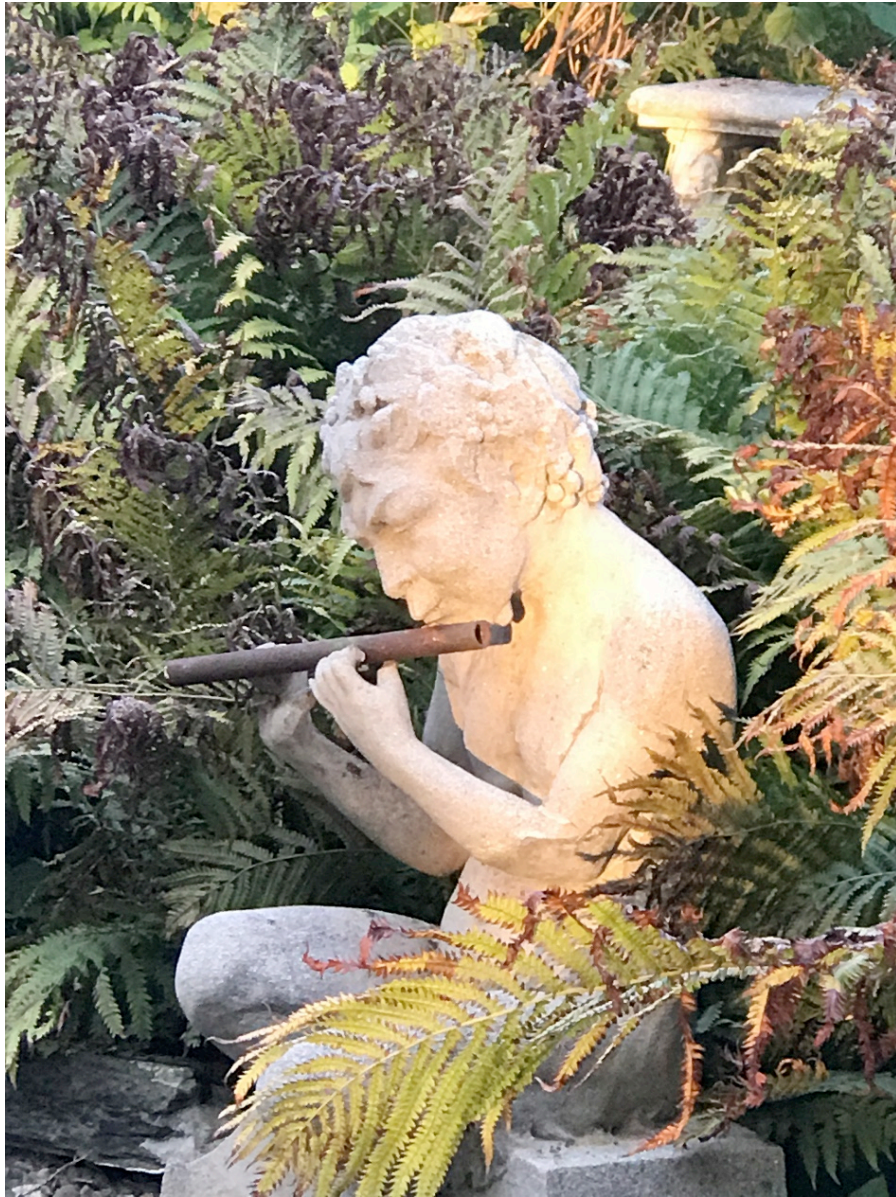
“Sunset at Brookwood” Brookwood Garden