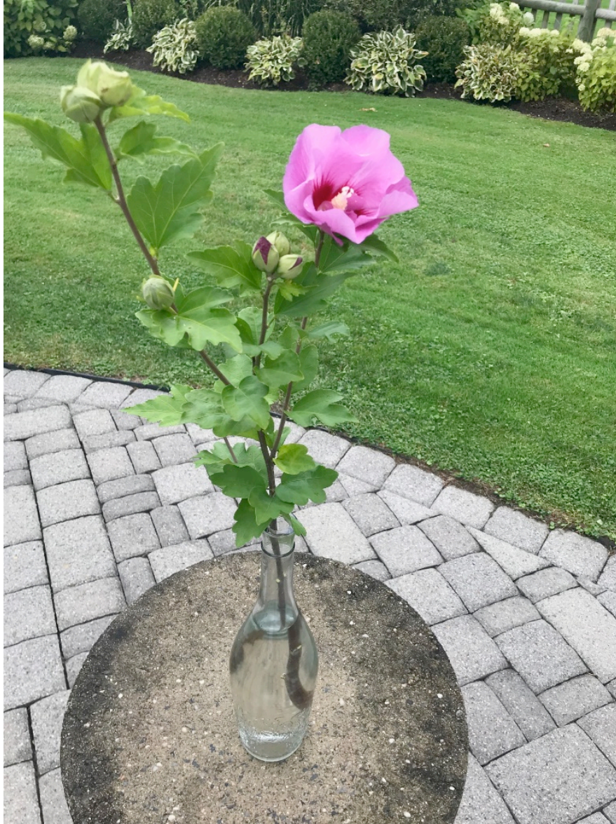
Class 4: Hibiscus syriacus Common name: Purple Rose of Sharon